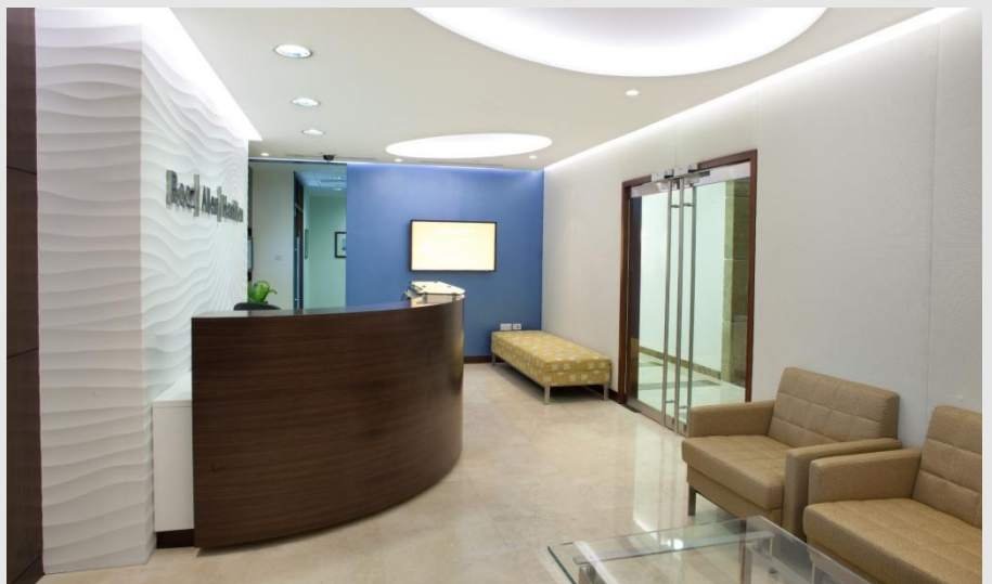
Booz Allen Hamilton